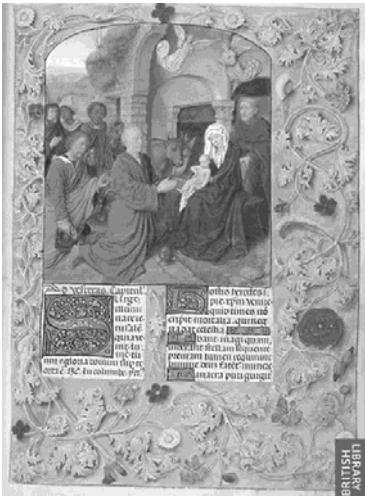
Adoration of the Magi. Breviary of Isabella de Castile, Gerard David, 1480's, Bruges. Additional MS. 18851, f. 41.