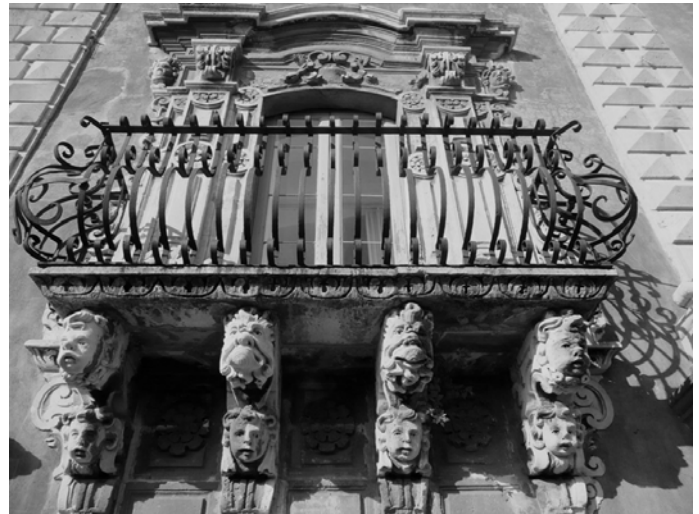
A balcony on the Monastery of Saint Nicholas in Catania, showing the mascheroni, or mask-like decoration, and wrought-iron balconies, variations of which are common in Sicily. The use of grey and white stone and the rusticated pilasters on either side of the balcony are more typical of the Catania area.