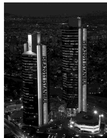
Above: The Sabanci Centre, venue of the conference.